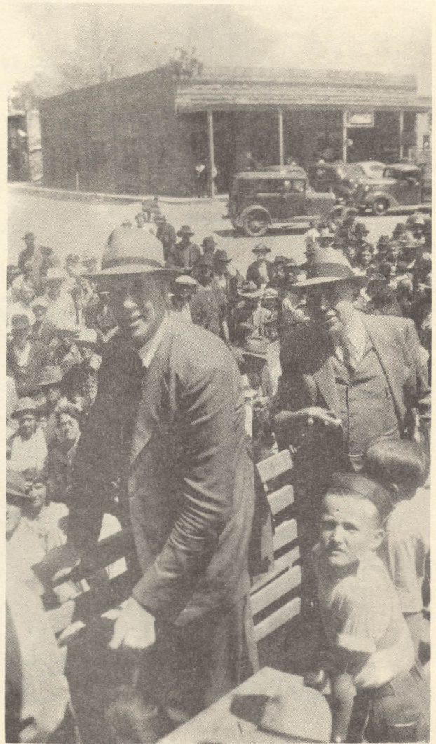
ROBERT WADLOW - over 8 ft. tall