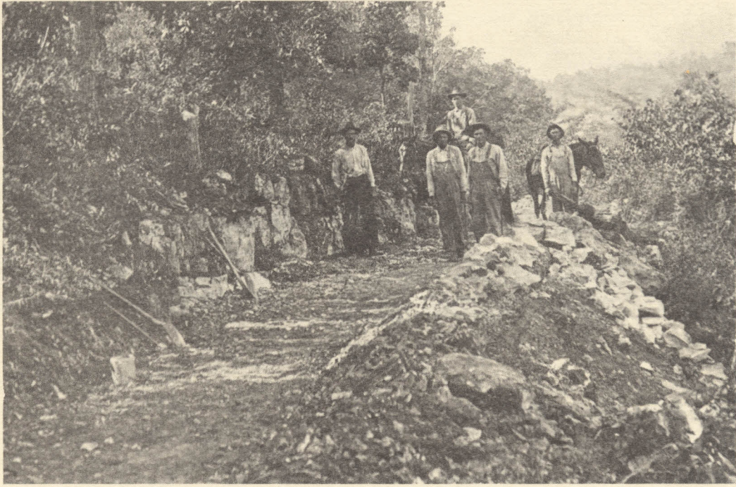
CLEARING 'HIGHWAY' THROUGH GOODALL HOLLOW