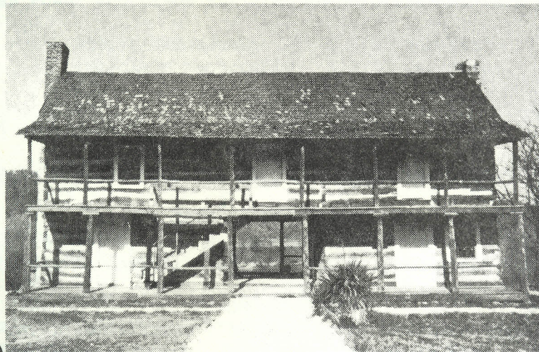
The Wolf House is the most historical building in Baxter County.